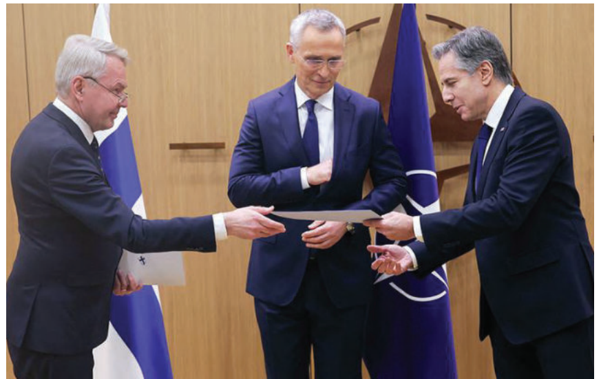
Expanding tribe: (from left) Pekka Haavisto, Jens Stoltenberg and Antony Blinken during in Brussels on Tuesday.

Mr. Blinken said: "I'm tempted to say this is maybe the one thing we can thank Mr Putin for. Because he once again here precipitated something he claims to want to prevent."