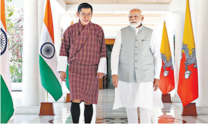
Bilateral cooperation: Prime Minister Narendra Modi with the King of Bhutan, Jigme Khesar Namgyel Wangchuck, in Delhi. King Jigme Khesar Namgyel and Narendra Modi discuss 'entire gamut' of ties and progress in boundary talks between China and Bhutan, particularly about Doklam, says Foreign Secretary

India and Bhutan remain in "close coordination" over all security matters, Foreign Secretary Vinay Kwatra said on Tuesday. He indicated that Prime Minister Narendra Modi and Bhutanese King Jigme Khesar Namgyel Wangchuck discussed the latest situation along the India-Bhutan border as well as the progress in boundary talks between China and Bhutan, particularly above the Doklam trijunction point, during a meeting in Delhi.